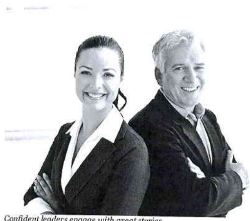
Confident leaders engage with great stories.