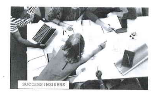
1 Colid Evamples Of Heina Online