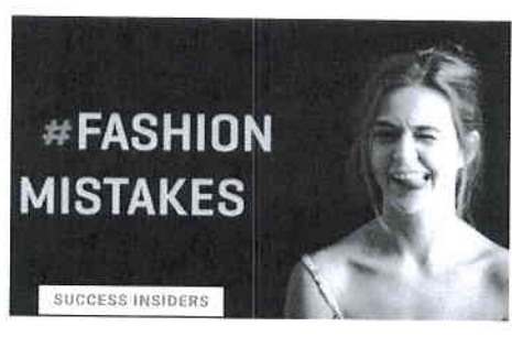
Mixed and Mismatched: What happened to these Clothes?